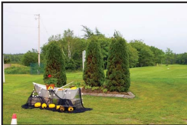
West Pubnico Golf Course