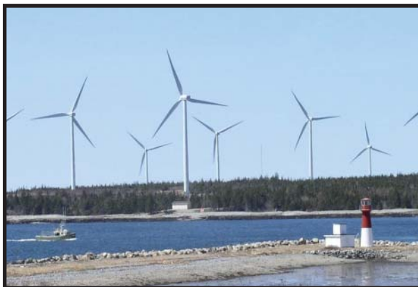
Pubnico Wind Farm