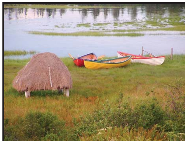
Salt Marsh Haystack

In this pre-1920's Acadian village, discover the heart, life and work of the Acadians of Pubnico whose ancestors were led to this community in 1653 by its founder, Sieur Philippe Mius-d'Entremont.