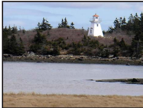
Lighthouse, du Village

Situé sur un site de 17 acres, le Village historique acadien rend hommage aux Acadiens de la Nouvelle-Ecosse.